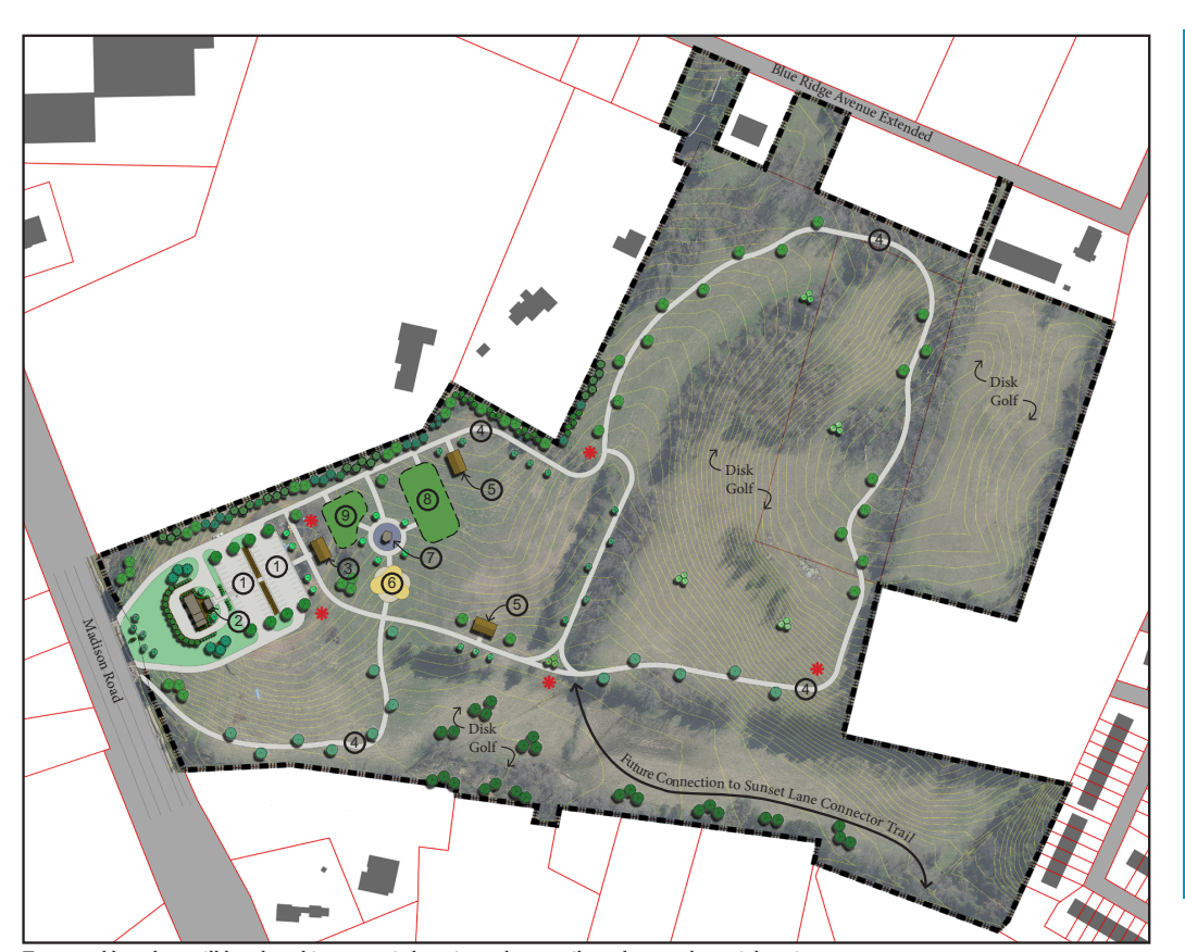
Trees and benches will be placed in strategic locations along trails and around special projects.